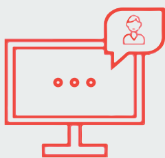
Bespoke Software Solutions

Dataconversion's solution allows them to manage this process smoothly, while the reporting and analytics elements of the solution continuously monitors ways of improving this for their customers.