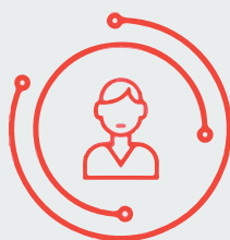
Customer Experience & Engagement Strategies